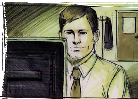
MONTHLY E-MAIL BULLETINS